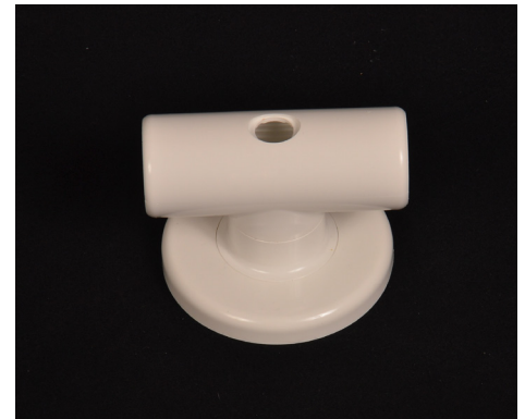
180° through elbow bracket (1)