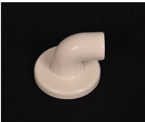
90° elbow bracket (3)