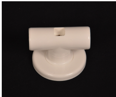
180° elbow bracket (3)