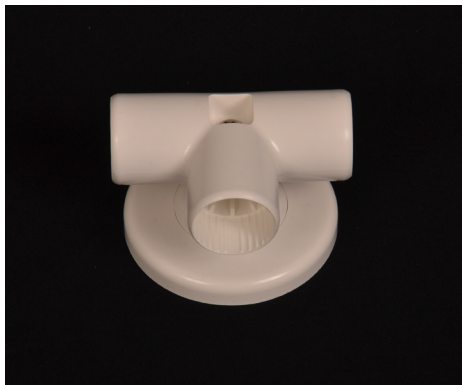
'T' elbow bracket (1)