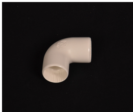
90° elbow fitting (1)