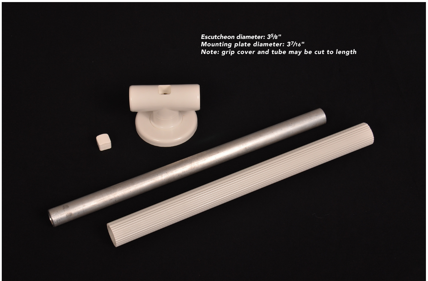
Extension Bar Kit